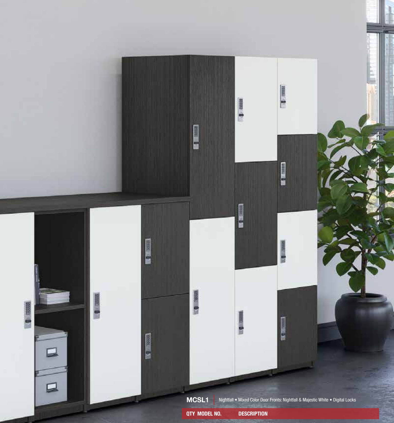
MCSL1 | Nightfall • Mixed Color Door Fronts: Nightfall & Majestic White • Digital Locks