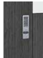
Electronic Keypad Digital Lock Permanent or shared use, 4-digit user code & 6-digit user code