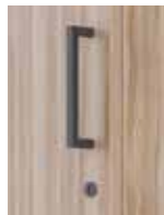
Bar Square Handle Black (MMH10B) and Face Lock