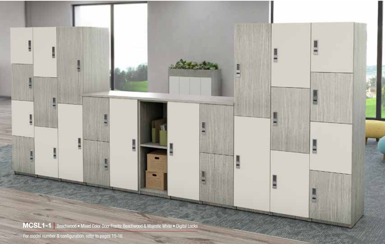
MCSL1-1 | Beachwood • Mixed Color Door Fronts: Beachwood & Majestic White • Digital Locks

For model number & configuration, refer to pages 15-16